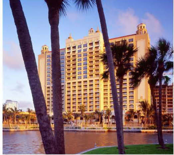
"Sarasota is not a beach town. People dress up here. They wanted a beautiful, elegant hotel."